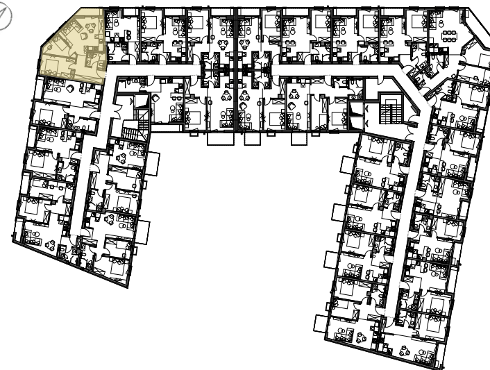
FASADA (KEY FACADE)